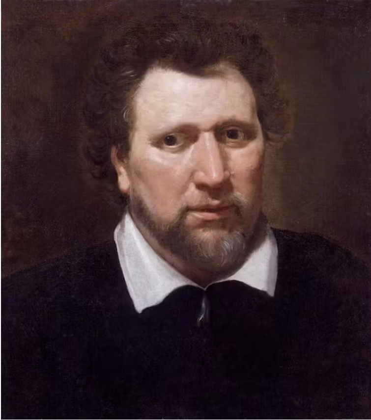
An early 19th century depiction of Ben Jonson by Abraham van Blyenberch.